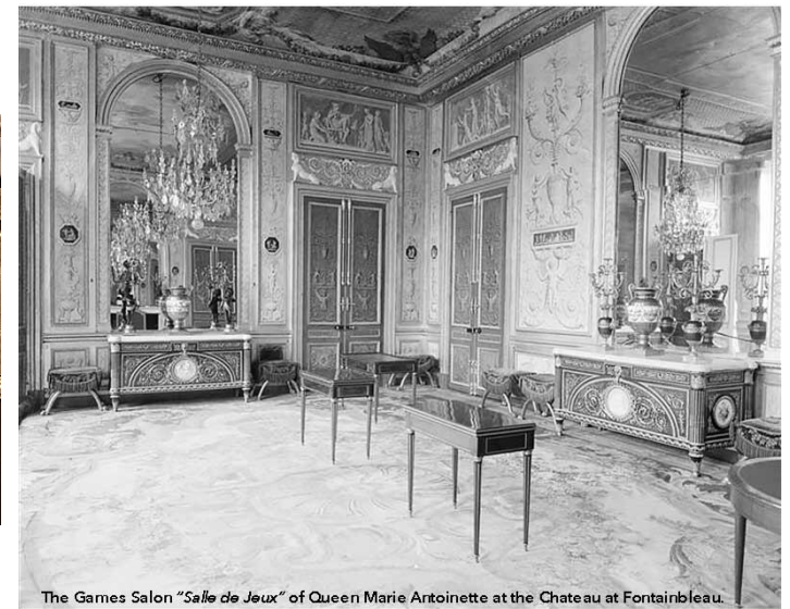
The Games Salon "Salle de Jeux" of Queen Marie Antoinette at the Chateau at Fontainebleau.